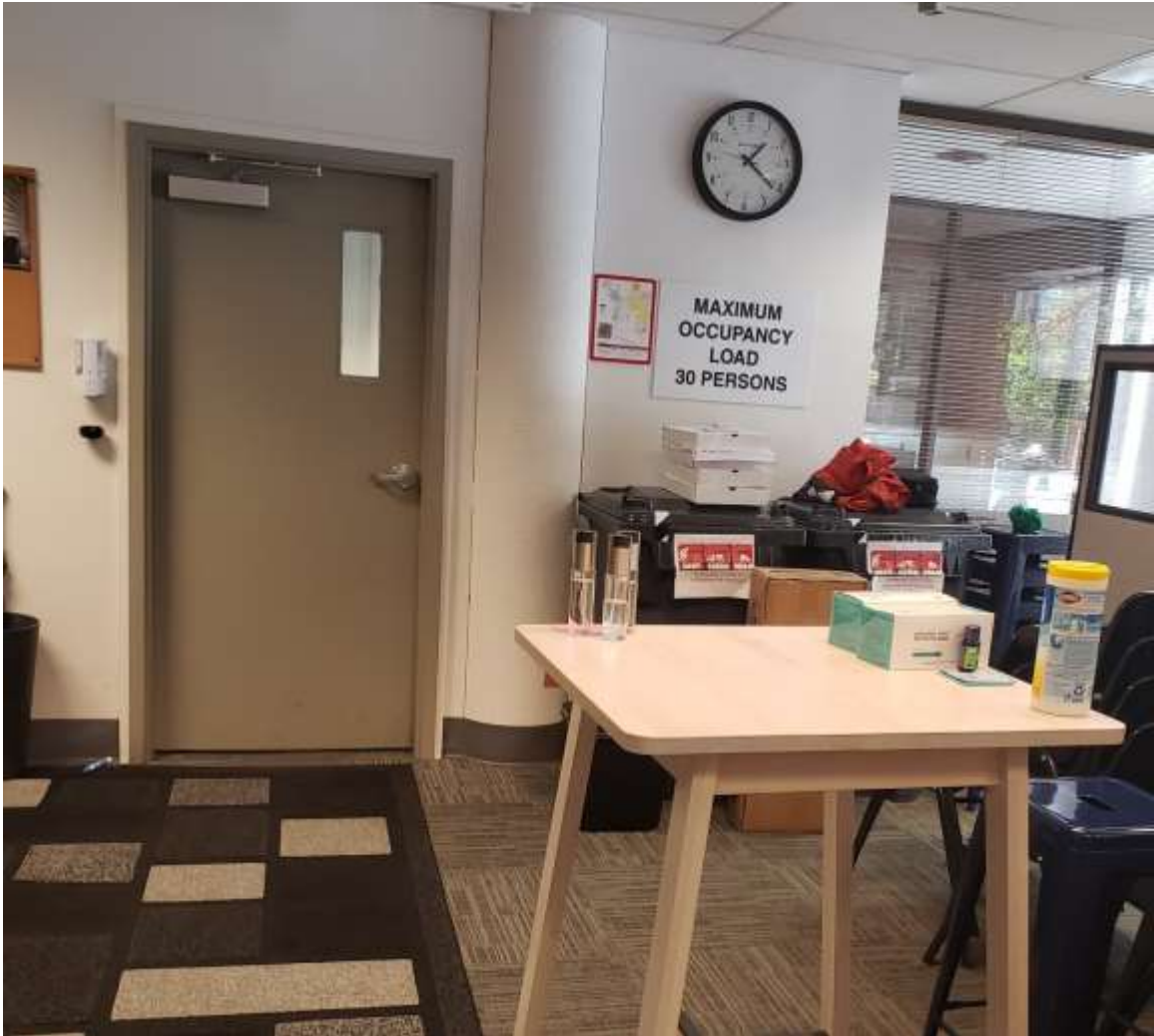
Welcome Desk, Front Door